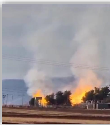
Power station in the city of Amuda