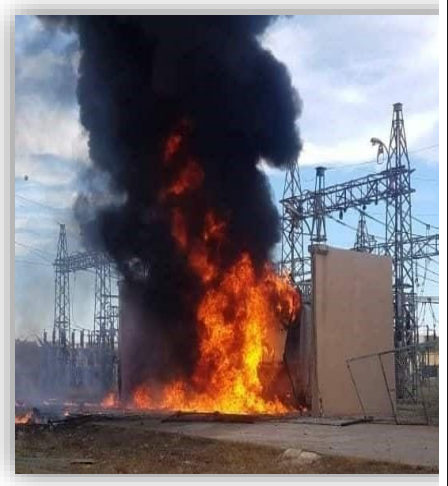
Power station in Al-Suwaydiyah/Derik