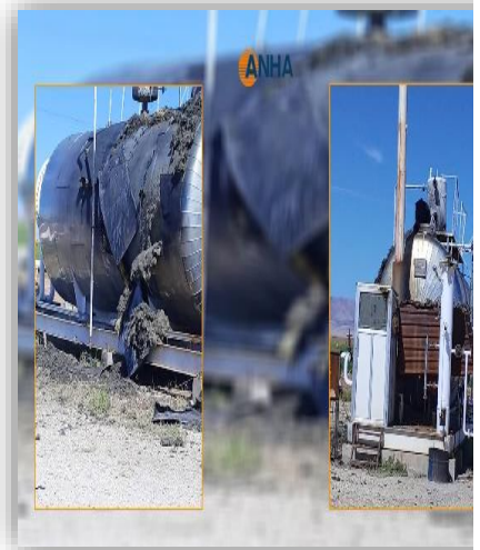
Saida Oil Station, Tarbesbeyeh/Al-Qahtaniyah