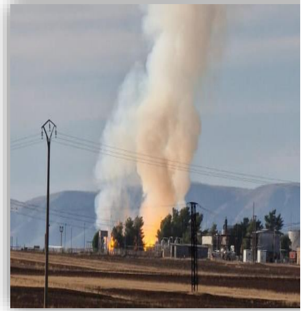
Ouda Oil Station in Terbesbeyeh/Al-Qahtaniyah