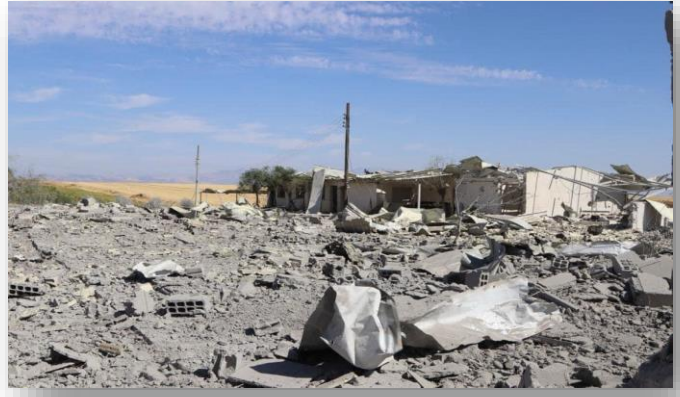
Corona Hospital in Giri Fara village/Derik city