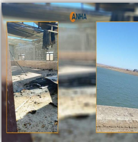
The targeting of the Jal Agha/Jawadiya Dam