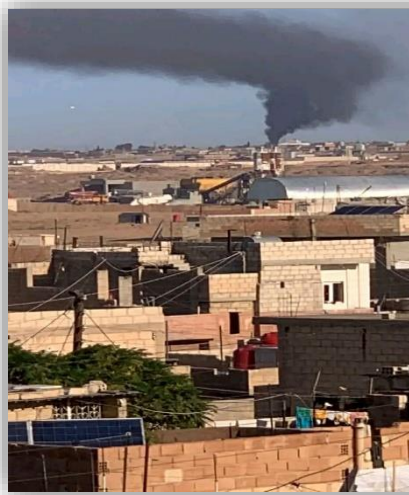
The targeting of a power station in Amuda