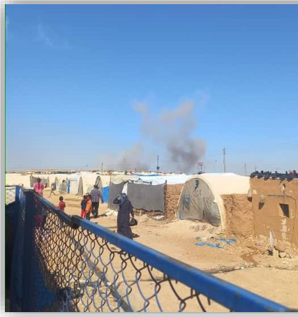
Washukanni Camp for IDPs in Al-Hasakah