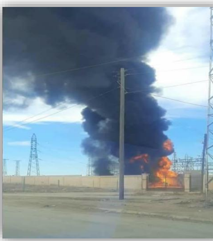
Power station in the city of Qamishli