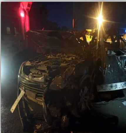
The targeting of a civilian car in Al-Hasakah